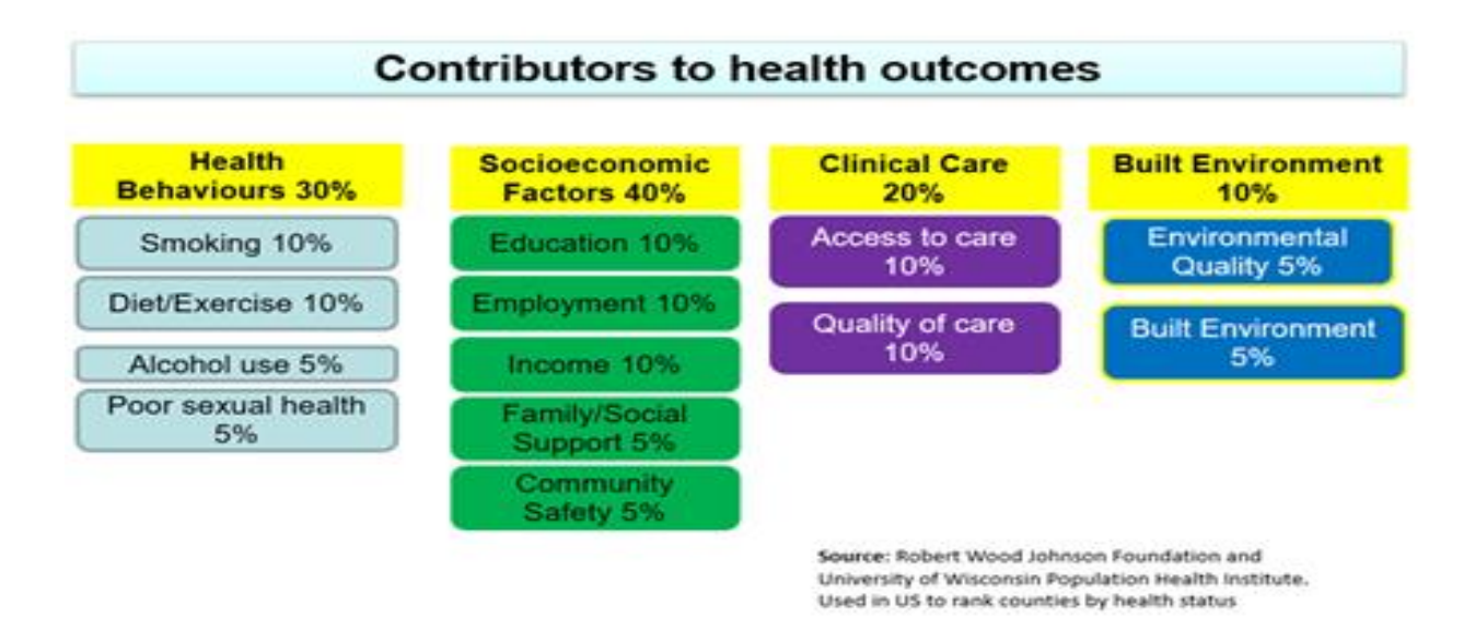
Figure 5 Contributors to health outcomes