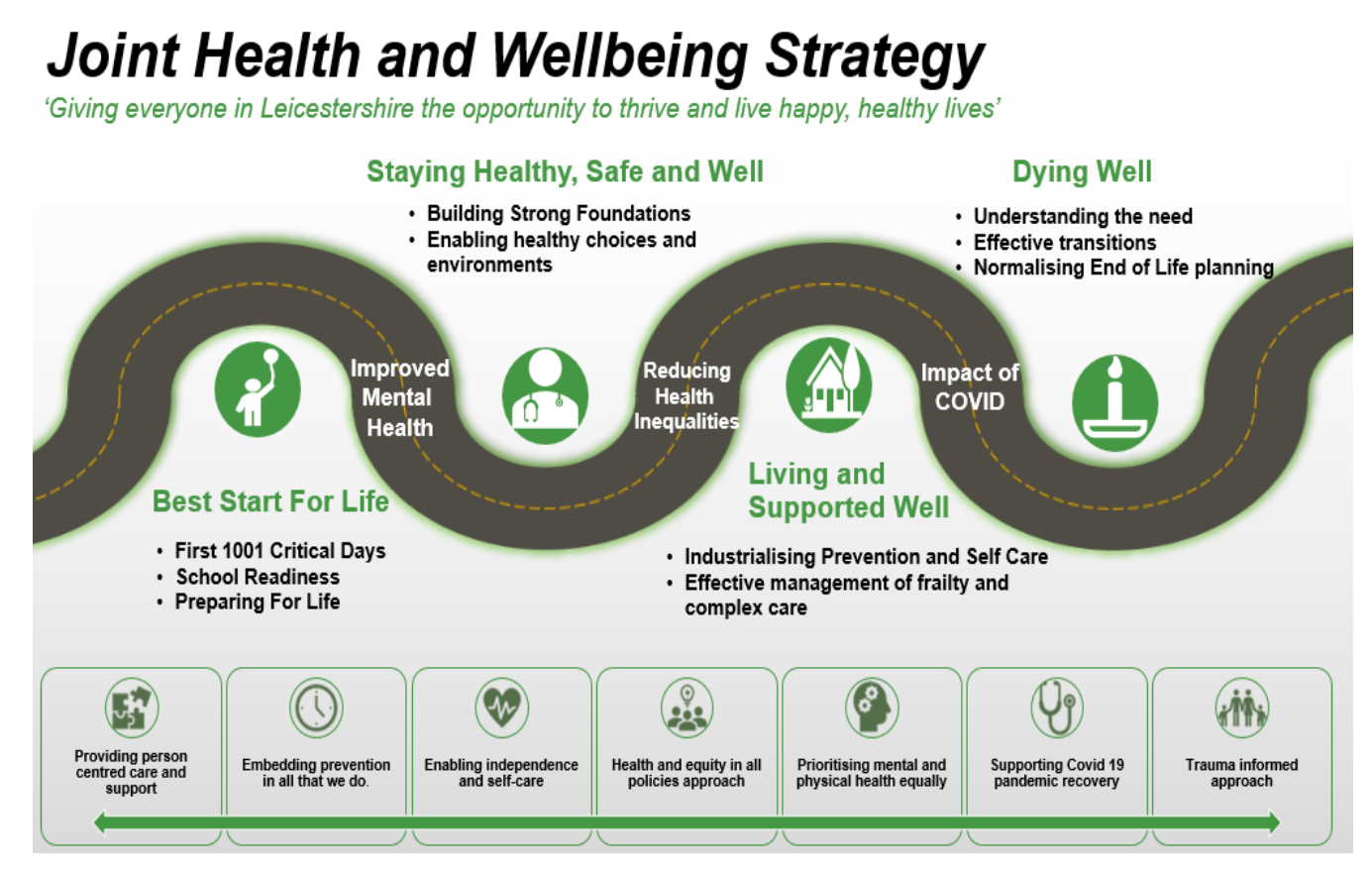
Figure 4 Summary of the Joint Health and Wellbeing Strategy

To allow everyone across Leicestershire the best opportunity to live long, good quality, happy lives we will where possible, embed the following principles in our priorities and actions;